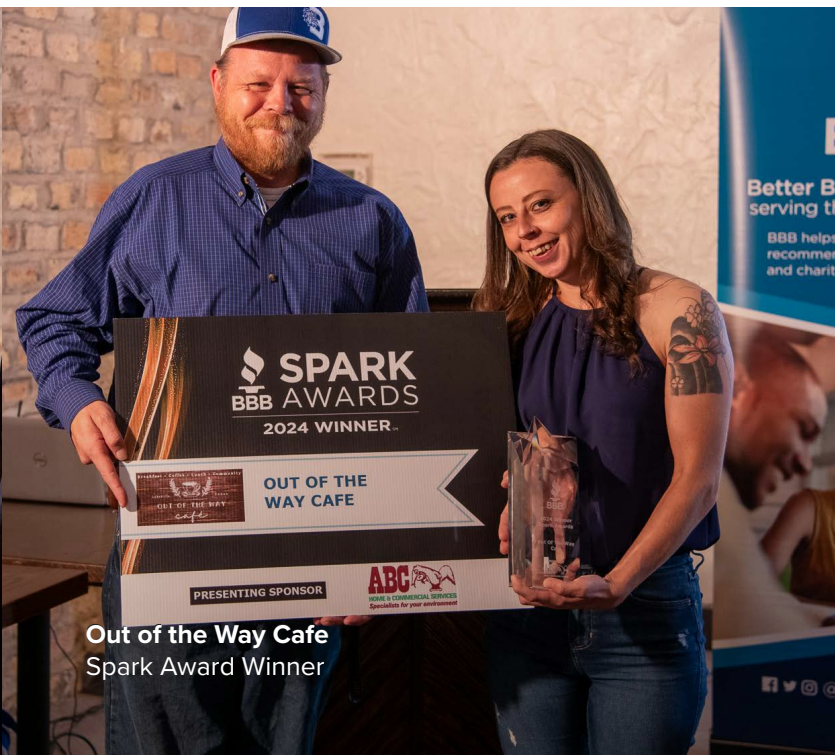
Out of the Way Cafe Spark Award Winner