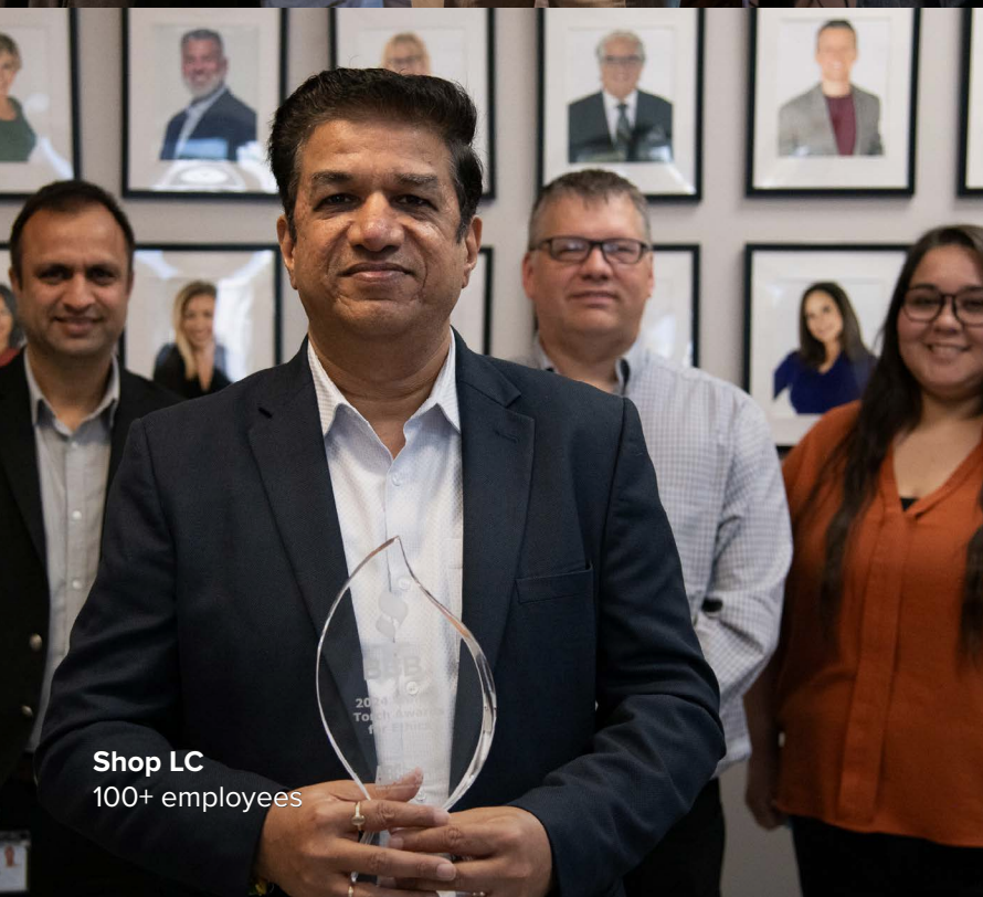
Shop LC 100+ employees