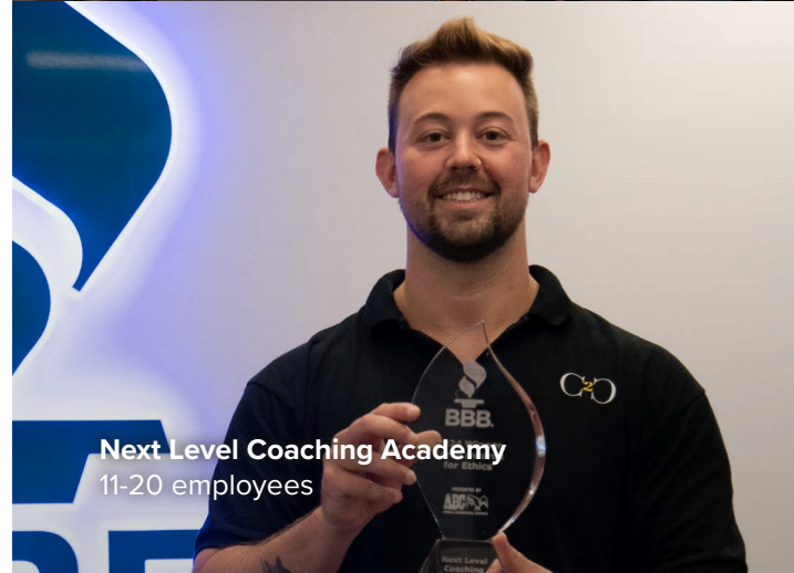
Next Level Coaching Academy 11-20 employees