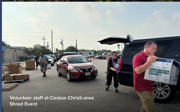
Volunteer staff at Corpus Christi-area Shred Event