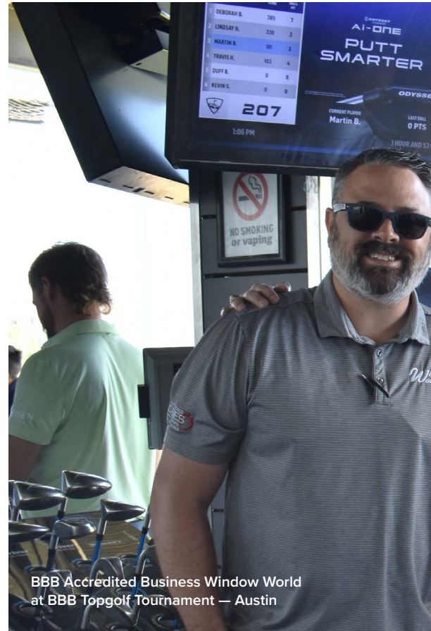
BBB Accredited Business Window World at BBB Topgolf Tournament — Austin

A special thank you to our sponsors, teams, and community partners who made this event possible. We look forward to continuing this tradition in 2025 and furthering our mission to empower businesses across Texas!