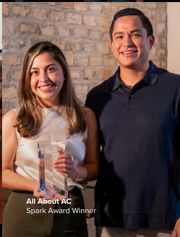
All About AC Spark Award Winner

Thank you to the 2024 Torch and Spark Awards Sponsors!