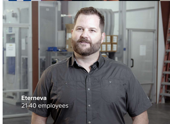
Eterneva 21-40 employees