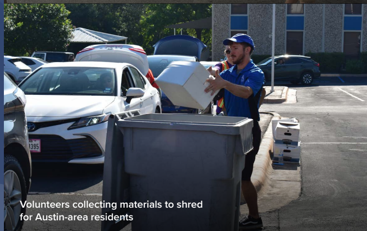
Volunteers collecting materials to shred for Austin-area residents