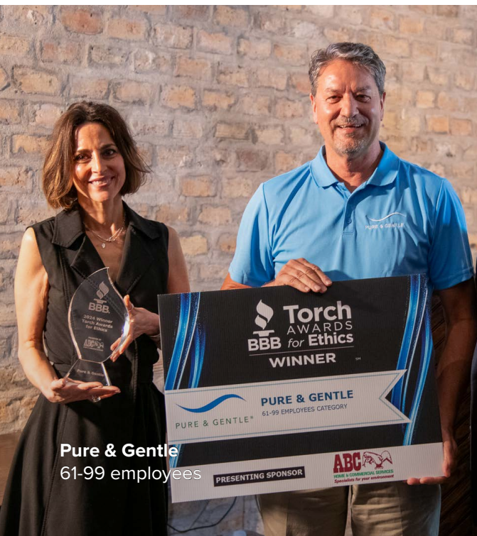
Pure & Gentle 61-99 employees