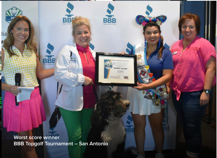
Worst score winner BBB Topgolf Tournament – San Antonio