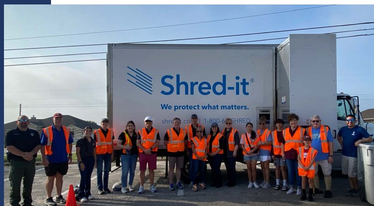
Shred Day volunteers at San Antonio-area event