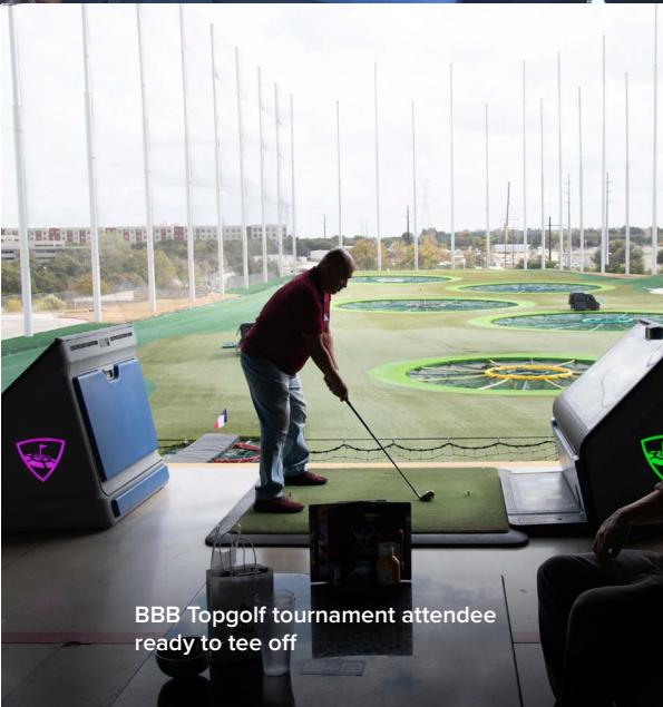
BBB Topgolf tournament attendee ready to tee off