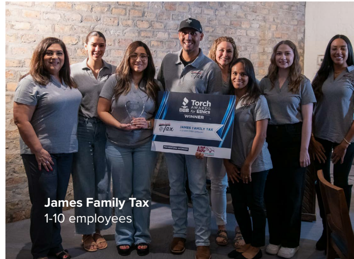
James Family Tax 1-10 employees

Together, the Torch and Spark Awards set a benchmark for ethical business practices, inspiring companies of all sizes to lead with honesty, accountability, and a dedication to strengthening trust in the marketplace.