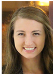
Miranda Thesing-Ritter Memorial High School